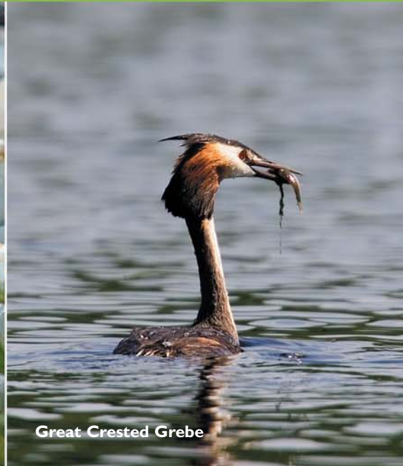
Great Crested Grebe