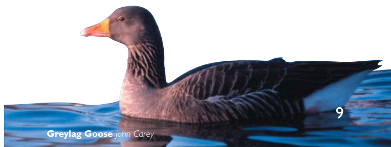
Greylag Goose

Lurgangreen attracts Greylag and other goose species in winter.