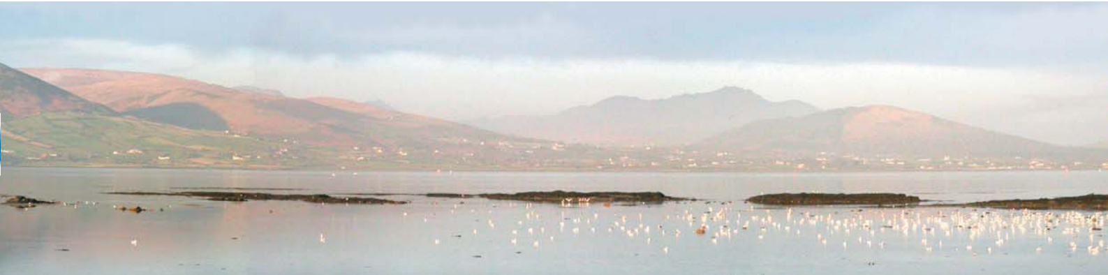
Carlingford Lough and the Mountains of Mourne